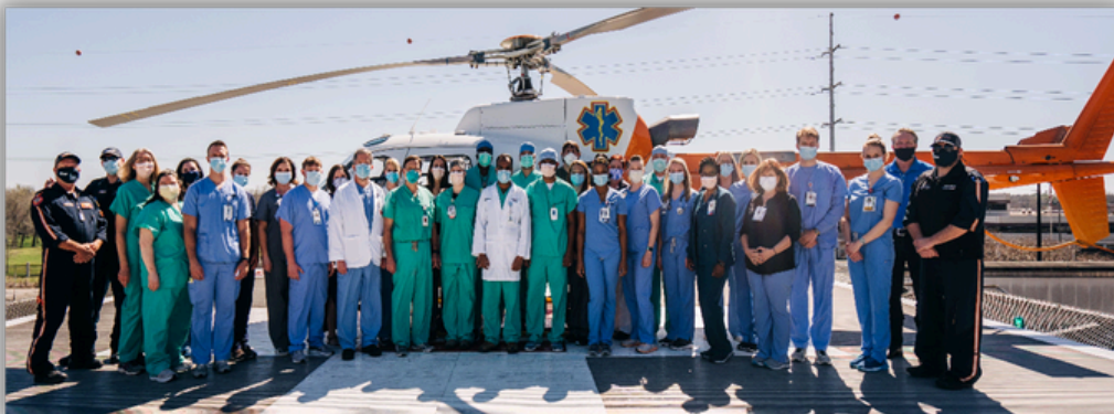
Baptist Medical Center South Thrombectomy Team

In parallel, our recruitment team worked hand-in-hand with the project team at Baptist Medical Center South to identify a neuro-interventionalist, who will join the organization in August 2021. While the search was in progress, Corazon placed an Interim Stroke Program Manager to ensure program momentum and operational focus while the search for a permanent hire for this pivotal program leadership role was underway. Within 5 months, a Stroke Program Manager was hired with orientation support provided by Corazon.