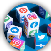
Social Media Package