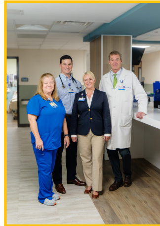
SE Georgia team at the Clinical Decision Unit.

Southeast Georgia Health System has achieved remarkable success with the launch of their Clinical Decision Unit (CDU) for cardiac care, with Corazon providing crucial support throughout the implementation.