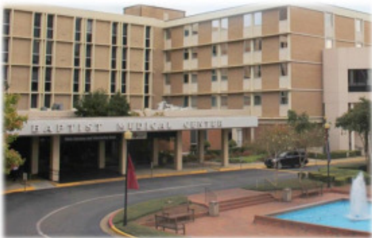
Main Entrance, Baptist Medical Center South

Promoting and expanding the neuroscience service composition and capabilities at Baptist Medical Center South (BMCS), the flagship of a three-hospital system in south-central Alabama, was deemed a strategic priority. This was in large part due to the tremendous growth and success of the system stroke program under the direction of the Stroke Program Medical Director. The Baptist team worked with Corazon to construct a comprehensive plan for a full service neuroscience program development, including a detailed market analysis, target volume projections with associated projected financial return, a physician manpower needs assessment, and an operational implementation plan based upon community need and best practice standards.