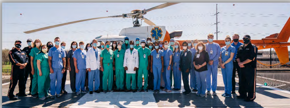
Baptist Medical Center South Thrombectomy Team

In parallel, our recruitment team worked hand-in-hand with the project team at Baptist Medical Center South to identify a neuro-interventionalist, who will join the organization in August 2021. While the search was in progress, Corazon placed an Interim Stroke Program Manager to ensure program momentum and operational focus while the search for a permanent hire for this pivotal program leadership role was underway. Within 5 months, a Stroke Program Manager was hired with orientation support provided by Corazon.